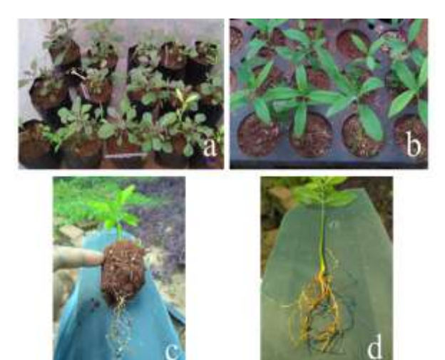
Plate 1: a) S. album plantlets with host Alternanthera brasiliana. b) S. album plantlets without host. c& d) S. album plantletsshowing haustorial connections and growth after four months of biofertilizer application.